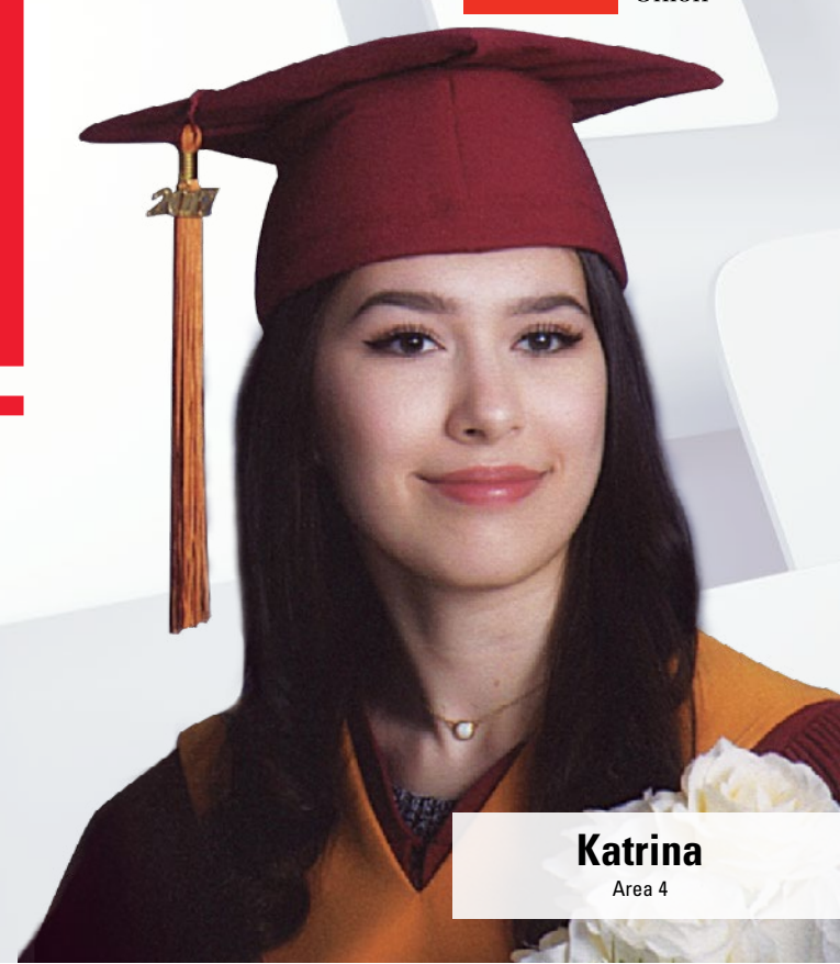
Katrina Area 4